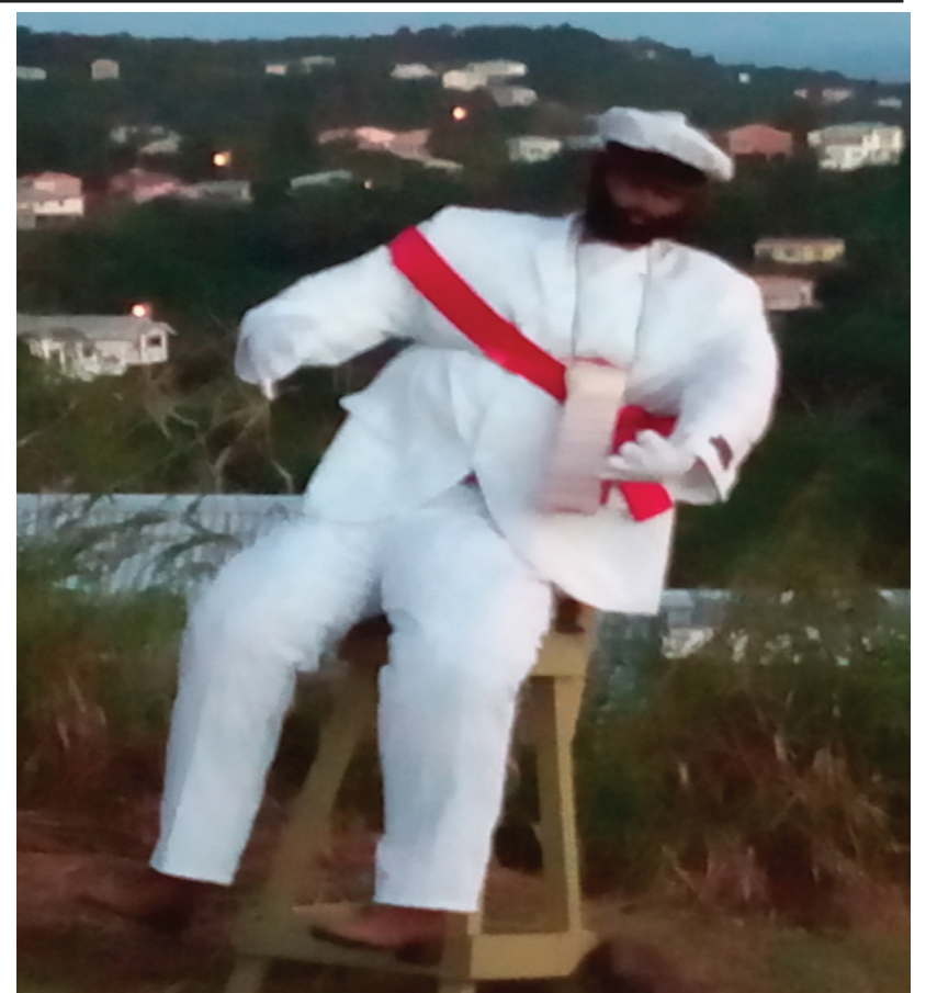
The effigy of Guido Fawkes in Morne Jaloux

Wintour introduced Fawkes to Robert Catesby, who planned to assassinate the King. The plotters leased an undercroft beneath the House of Lords, and Fawkes was placed in